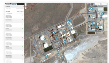
Blackline Live safety monitoring portal