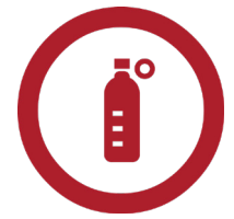
Custom inlet configuration