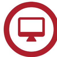
Blackline Live™ portal