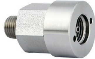
1/4" NPT -M X C10 F