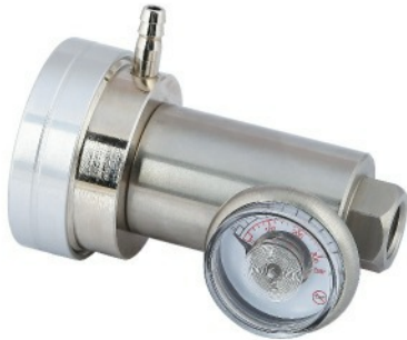
HP Demand Flow Regulator