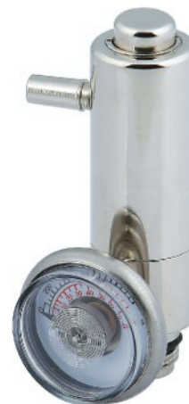
Push Button Regulator