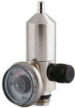
Fixed Flow Regulator Brass Nickel Plated