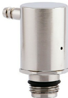
Small Fixed Flow Regulator C10