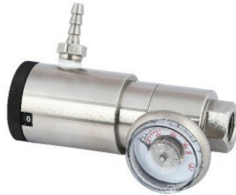
HP VFR-Stainless Steel/ Aluminum anodized