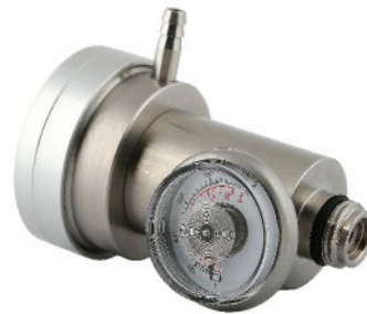
Demand Flow Regulator Stainless Steel

Demand flow regulator used for calibration gases, pump based instruments and hand held gas detectors. Demand flow regulator supply gas as demanded by the instrument and automatically shuts off.