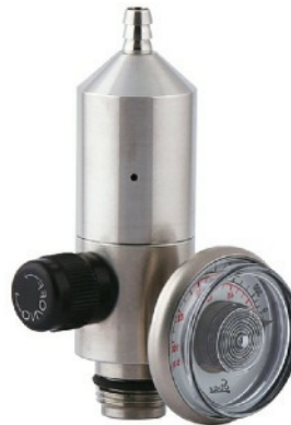
Fixed Flow Regulator Stainless Steel