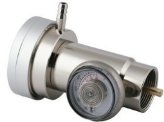
CGA600 Demand Flow Regulator