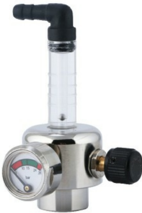
FCV-Aerosol inlet with gauge