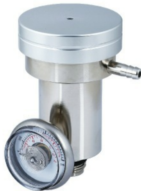
Demand Flow Regulator Brass Nickel Plated