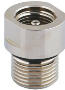
C10 Aluminum Valve ENP plated-3/4"UN inlet