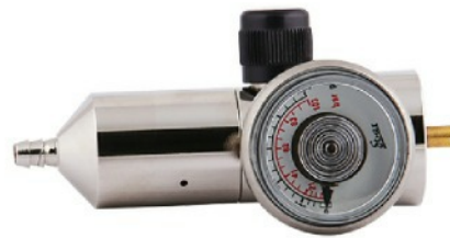
Fixed Flow Reg CGA600