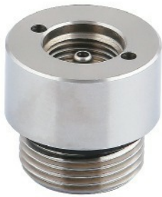
C10 Stainless Steel Valve