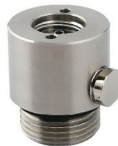
C10 Stainless Steel Valve with temperature relief fuse