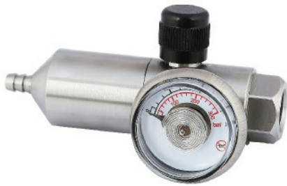
HP Fixed Flow Regulator