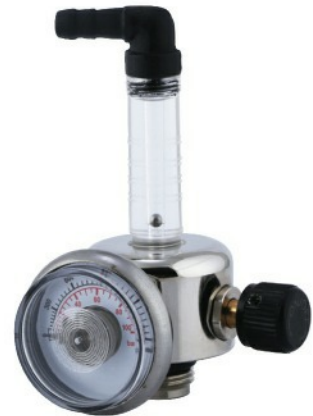
FCV-C-10 inlet with gauge

Flow control valves are used for calibration gases and industrial safety monitors.