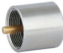
CGA600 x C10 F