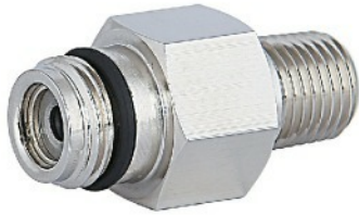
C10 x 1/4" NPT-M