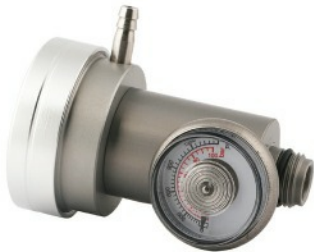
Aluminum Demand Flow Regulator