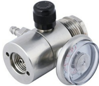
Integrated C10 Valve + Regulator

Integrated C10 valve + fixed flow regulator is a combo product which will benefit the user with no contamination of gases and hassle free use as the pressure reducing regulator is inbuilt.