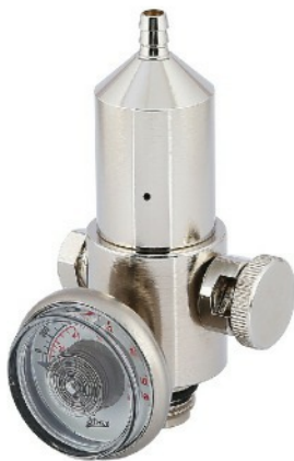
Push Type Regulator