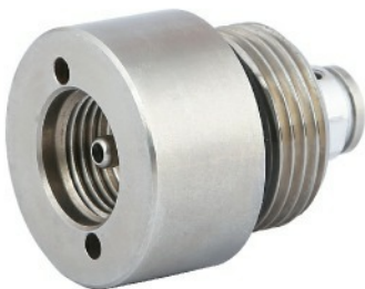
Non-Refillable C10 Stainless Steel Valve