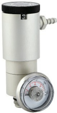
VFR Aluminum anodized