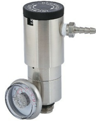
VFR- Stainless Steel/ Aluminum anodized

Vari-flow regulators are used for calibration gases and industrial safety monitors. These are available in preset flow settings from 0.3 to 8.0 LPM.