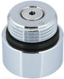
C10 Brass Nickel Plated Valve with temperature relief fuse