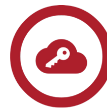
Single sign-on (SSO) functionality