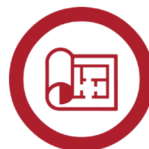
Custom maps & floor plans