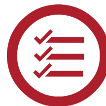
Alert management tools