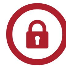
User roles & access controls