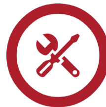
Wireless device configuration