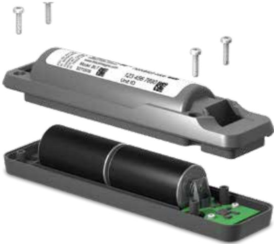
Easy Loner Beacon Battery Replacement